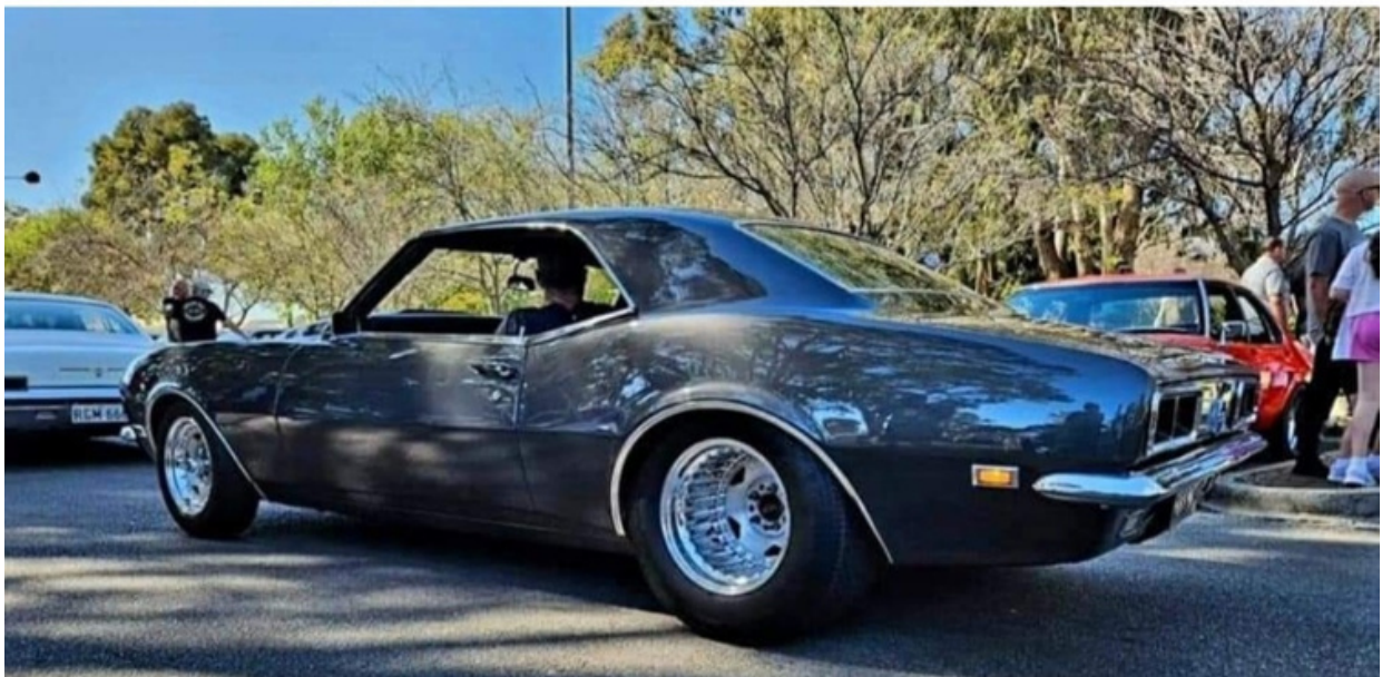
Ken's 1968 RS Big Block Camaro 582 All Aluminium BBC 2 speed powerglide