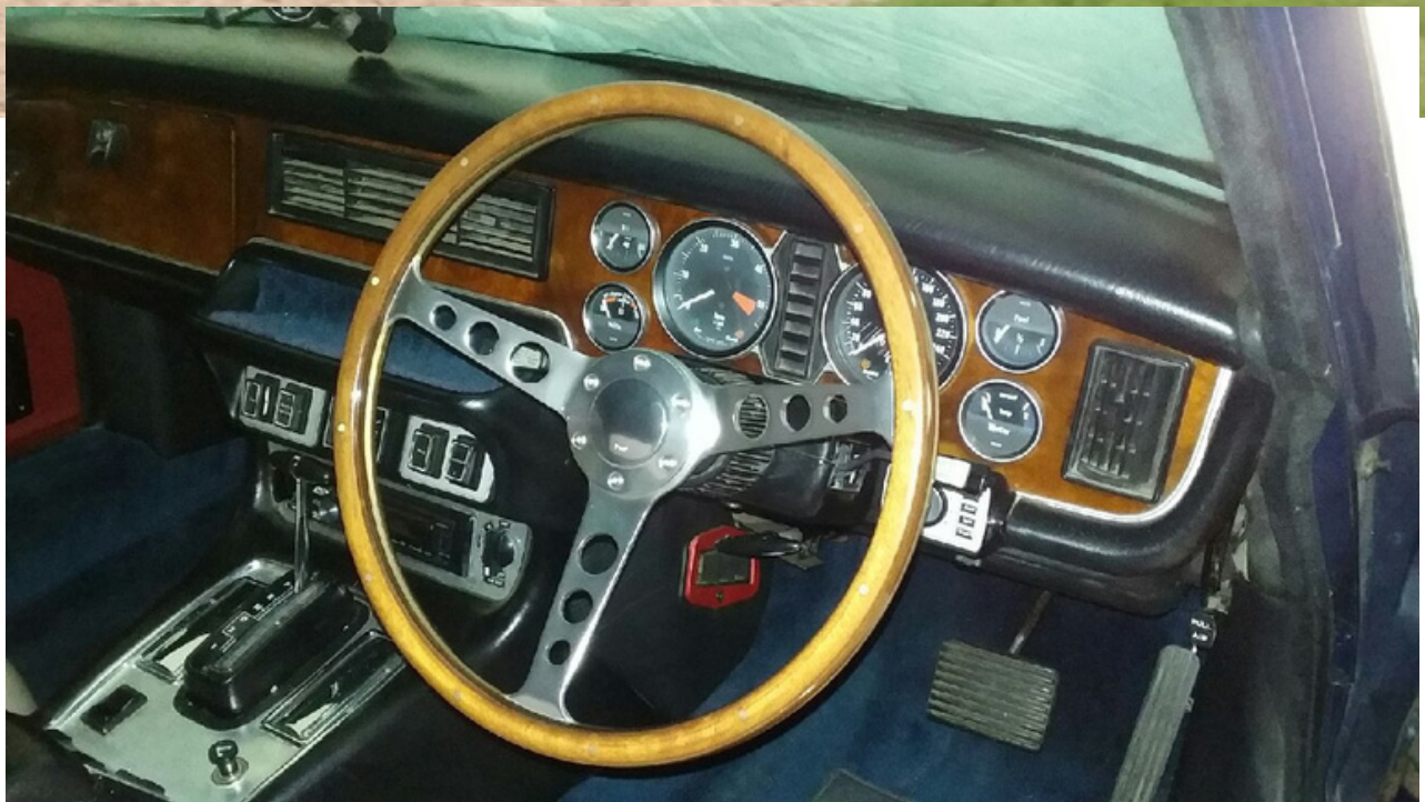
Liam's 1974 XJS Jaguar Short Wheel Base 305 CHEV V8 TH400 TRANS