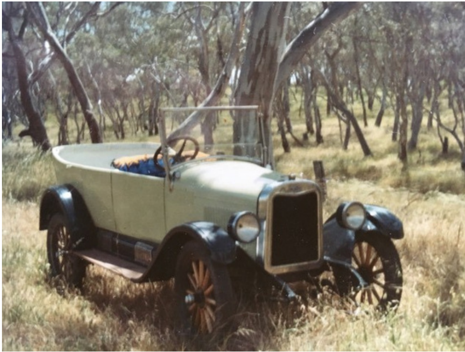
Damien's 1925 Chevrolet Tourer 171 Cubic inch 4 Cylinder 26 HP 3 speed manual