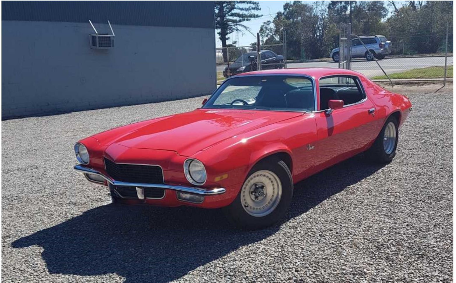
Rob's 1970 Chevrolet Camaro 427 Big Block Turbo 400 TRANS