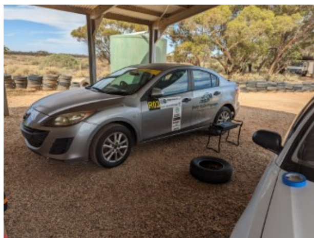
Cars washed and ready for Day 1

A huge thank you to all of the organising team for all their hard work, encouragement and input over the past 12 months (yes, it really did take that long to organise).