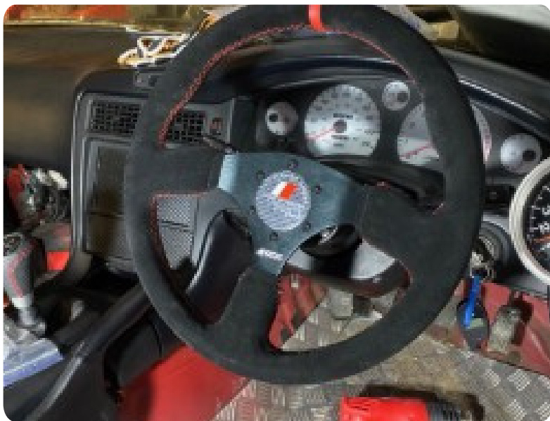
Colin Jack Collection Toyota MR2 Turbo , Toyota MR2 and Formula V