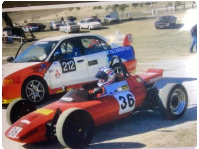
Colin Jack Collection Toyota MR2 Turbo , Toyota MR2 and Formula V